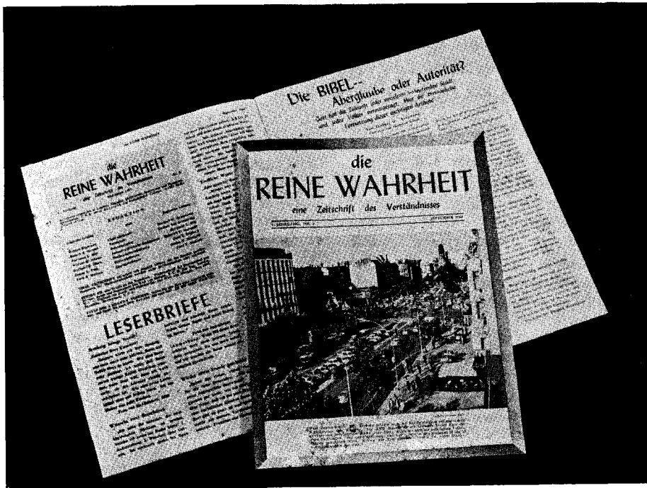
The September issue of Die REINE WAHRHEIT open to the lead article.